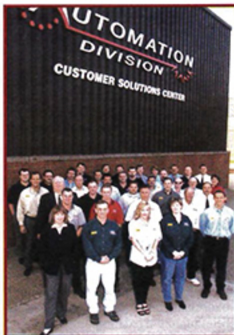
The staff of Lincoln's newly ISO 9001 certified Automation Division.